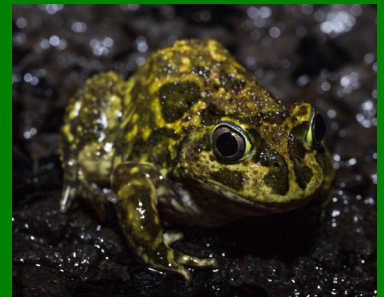
Sudells Frog ( Neobatrachus sudellae )